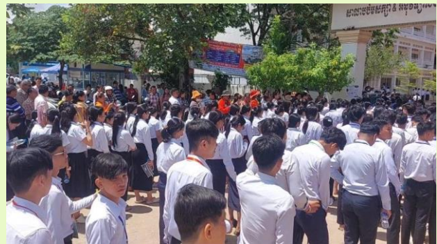
A total of 146,720 Cambodian students participated in the National Exam Grade 12.

Three of these students, waving the TFC Together for Cambodia flag. Hopes. Nerves. Racing heart. Knot in the stomach. I was more restless than them!. They've studied hard!. Day by day. The moment of truth has arrived.