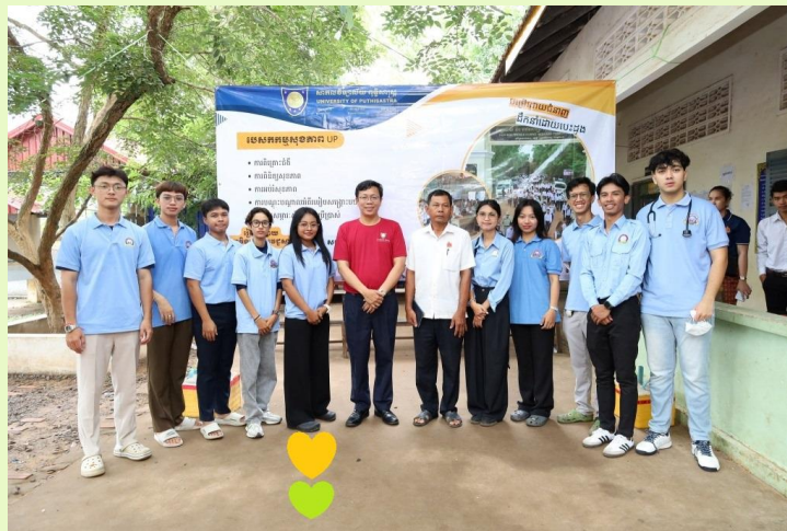
A new generation of future Khmer doctors.

The progress of quality for Cambodian public health is in your hands.