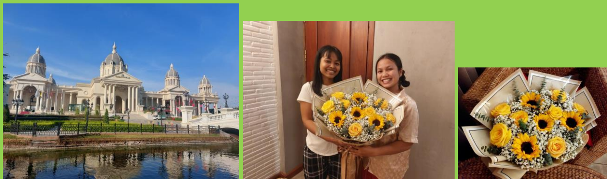
Outside the venue where the ceremony took place. Moment when SONY hands over the graduation bouquet the night before. The bouquet, an essential part of the event.

There were many magical moments. The day before, we went to investigate the location, since we had never been in that area of the city before. We were speechless, because the chosen venue was truly spectacular, new, spacious facilities and with a festive environment that enhanced it even more.